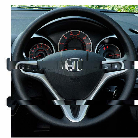
Seek/Track+ Volume +