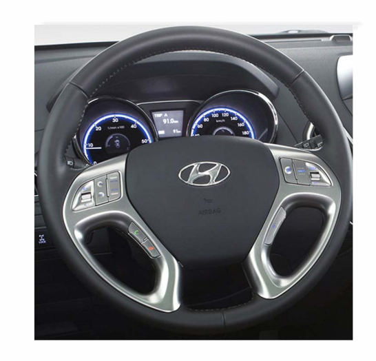
Steering Wheel Control Functions

For Vehicle Compatibility visit https://aerpro.com/CHHY9C