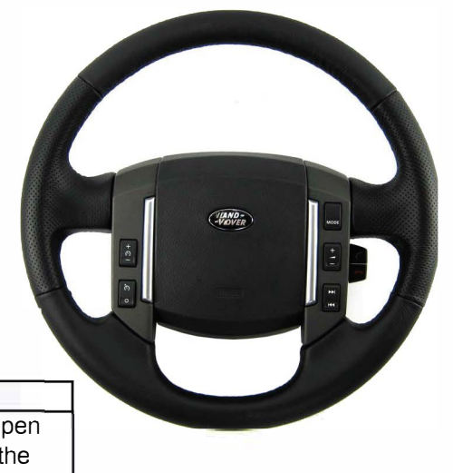
Steering Wheel Control Functions

For Vehicle Compatibility visit https://aerpro.com/CHLR6C