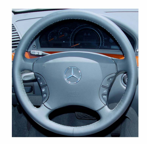
Steering Wheel Control Functions

For Vehicle Compatibility visit https://aerpro.com/CHMC3C