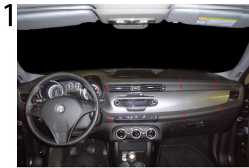
1 Connection points radio frame / Dashboard