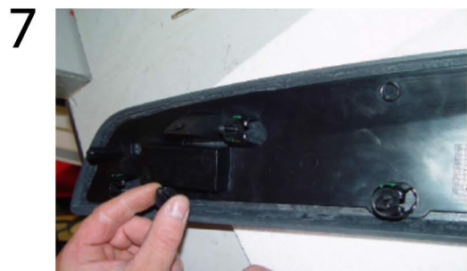
7 Insert the snap fastener to the radio frame supplied with the kit