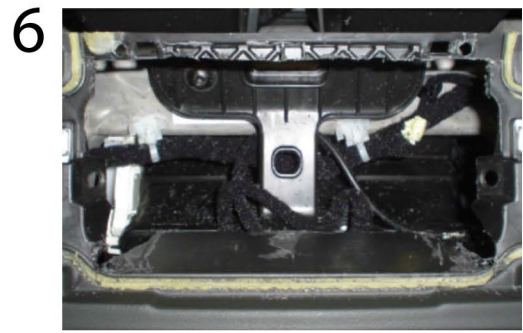
6 This is the result after cutting the plastic frame