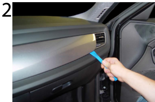
2 Remove the original panel starting at position shown