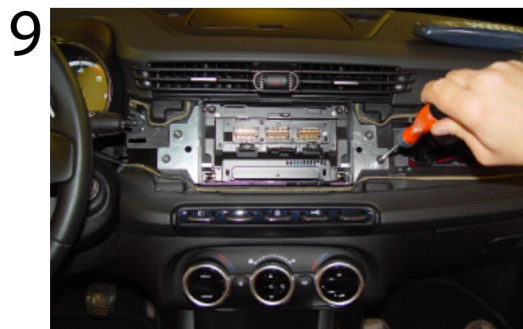
9 Connect all the cables then mount the radio and screw it into place