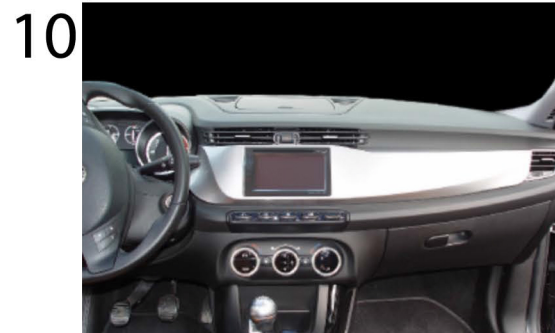
10 Clip the fascia into place. Installation is now complete