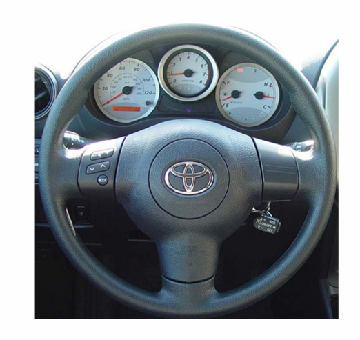
Steering Wheel Control Functions

For Vehicle Compatibility visit https://aerpro.com/ FP9218K